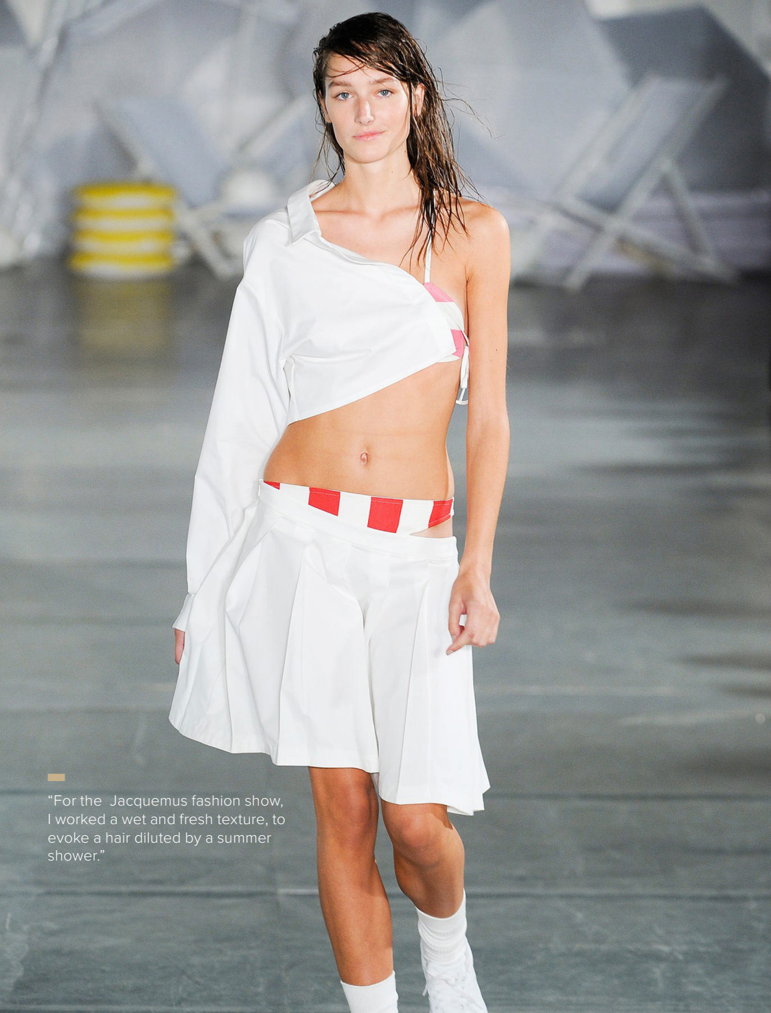
“For the Jacquemus fashion show, I worked a wet and fresh texture, to evoke a hair diluted by a summer shower.”